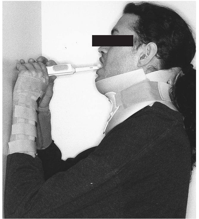
Figure 4. Independence in oral care is promoted through the use of orthotics and adaptive positioning, which increases upper-extremity stability.

bearing position while using the side wall to stabilize his head. While in this stabilizing position, he moved his face around the head of the razor (see Figure 5). Once stabilized, he was able to shave independently.